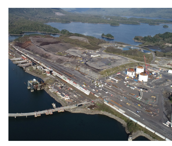
We are excited about the $1.2 billion of projects we are expecting to put into service throughout 2020, including the first phase of the Prince Rupert Terminal.

Pembina is in the customer service business and our goal is to deliver the most value to our customers and ensure that they are getting the highest value for their products. This goal is accomplished through our efforts to access new demand locations as well as expand our strategic presence in the Western Canadian Sedimentary Basin ("WCSB") both of which continue the ongoing build out of the 'Pembina Store'. Our development of the Peace and Northern pipeline systems has been completed in staged expansions. enabling us to deliver timely and reliable transportation service solutions for our customers. In addition to the Phase VI. VII and VIII expansions currently underway, we recently announced the approval of the first stage of the Phase IX expansion. Historically, Pembina has shipped the