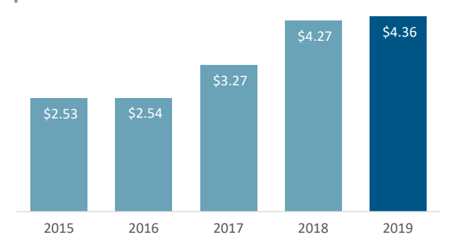
Dividends per common share